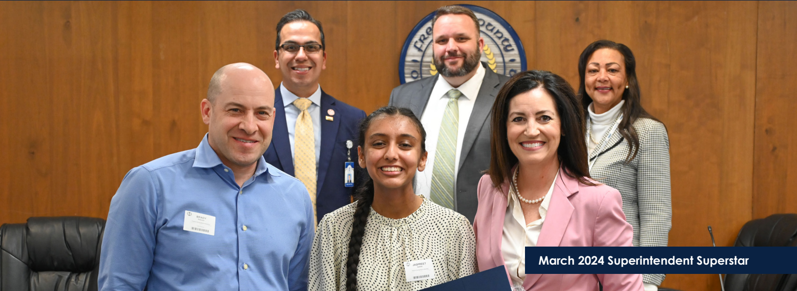
March 2024 Superintendent Superstar